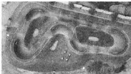
PA, Oakmont.jpg 1358K

Geri Uihlein <guihlein@stockbridgedda.org>