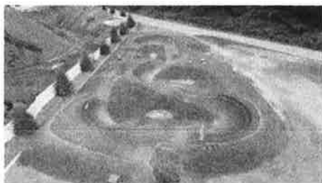
PA, Oakmont 3.jpg 866K