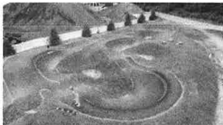
PA, Oakmont 2.jpg 816K